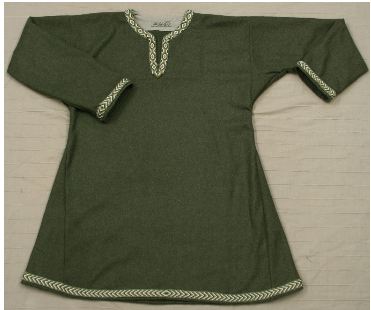
Example of a tablet woven band used as trim on a tunic.

The bands themselves were used almost entirely for personal adornment, often being sewn as a decorative trim onto clothing, worn as leg-wraps and occasionally also worn as a headband or attached to a hat or headdress. Archaeological evidence of inhumation show that the more extravagant materials, such as silk, silver and gold were worn by nobles, social figures or were part of religious rights and relics. 4