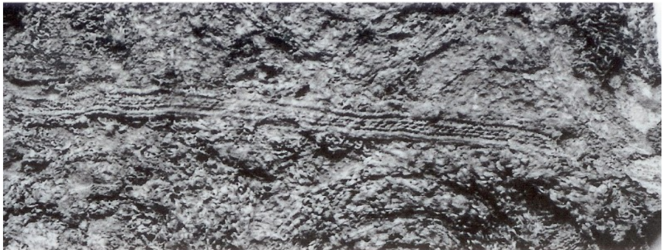
Picture of the Oseberg band taken during the archaeological dig. As the dig took place in 1903, no colour photographs exist and the textile decomposed shortly after being excavated. Drawings and notes taken by the involved archaeologists inform us further on the design, materials and colour.

The piece I have woven is a 40-strand reproduction of the Narrow Oseberg Band, which was found in one of the most extravagant and wealthy graves from the entire Viking Age, dated to 834 AD.