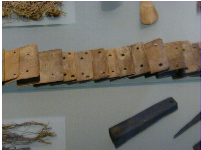
Wooden tablets from the Oseberg burial

one of the women is thought to have been a religious or spiritual leader, while the other woman is thought to have been a highly respected weaver, as she was buried with numerous textiles (including all the equipment needed to make textiles, and a half-finished tablet weaving that was still attached to the loom). 7 As textile material disintegrates somewhat quickly, an archaeological find that contained not only numerous examples of initially well preserved tablet weaving (and their patterns), but also surviving equipment, wooden tablets, looms, and even an in-progress piece has been invaluable in realizing and reviving how tablet weaving was authentically practiced.