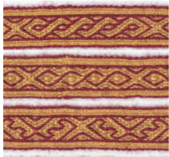
Recreations of tablet weaving from the Birka B12 and Mammen archaeological finds

Tablet weaving became extremely popular in Scandinavia particularly and, during the fourth to seventh centuries (the Migration Period), the practice in this area evolved into a more decorative approach, often denoting social status, personal wealth or great skill. 3 Some historical finds from this era demonstrate complex bands woven from expensive and imported goods such as silk, silver thread and gold thread.