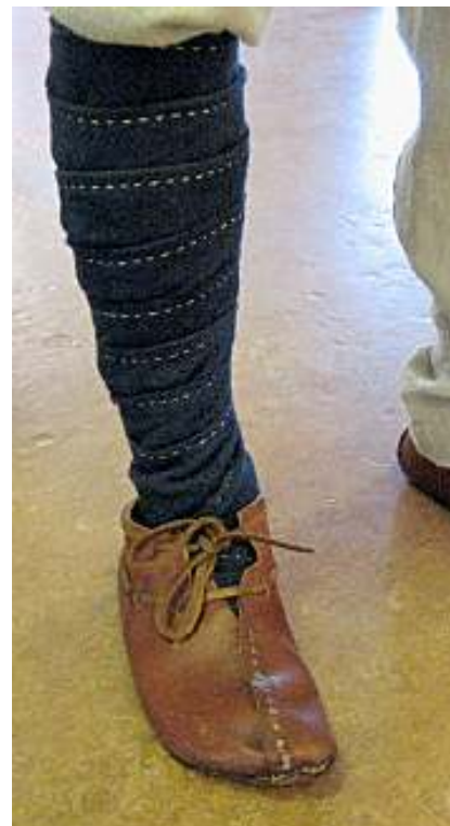
Tablet weaving used as a leg wrap.